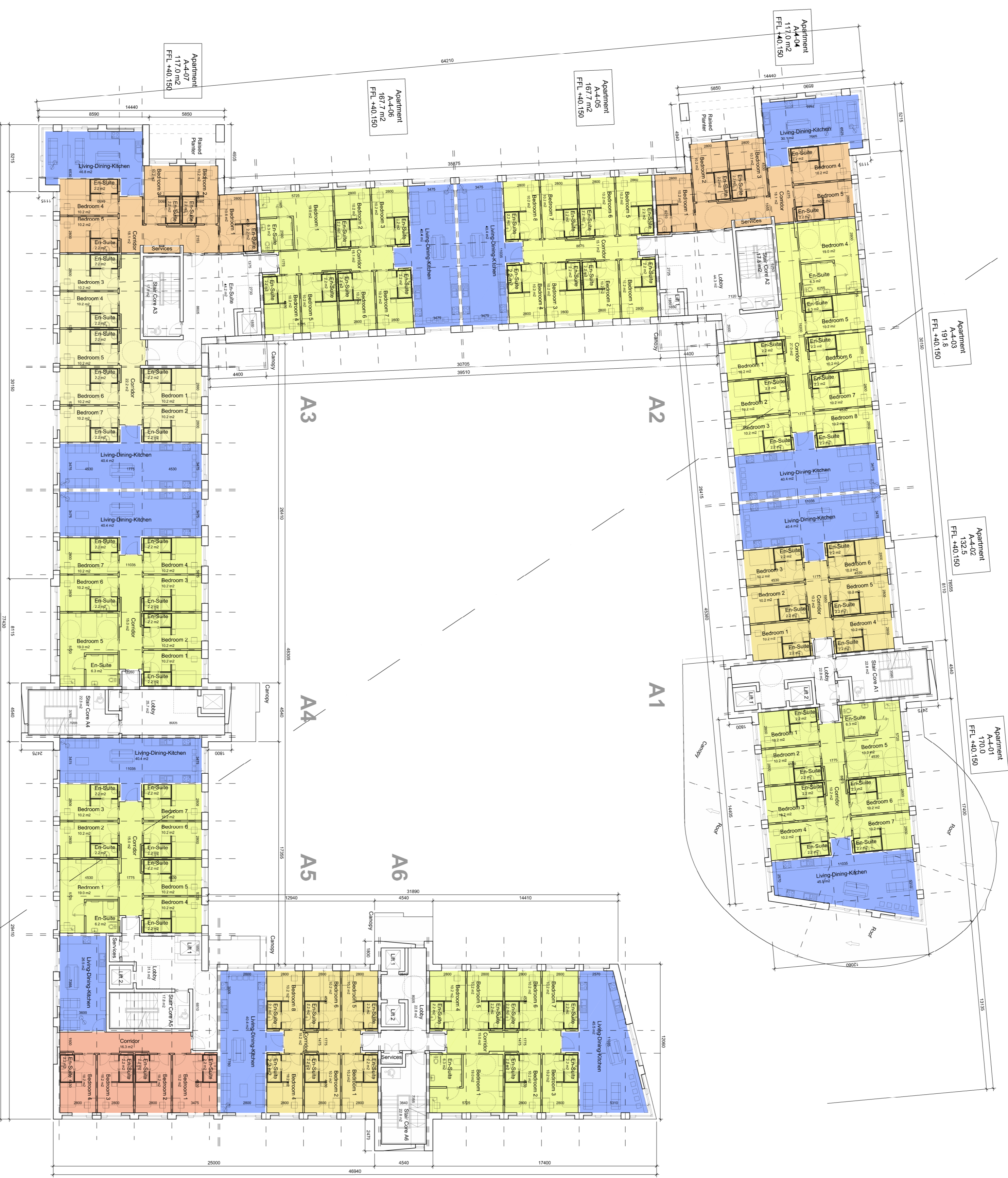
BLOCK A - APARTMENTS FOURTH FLOOR PLAN SCALE 1:200