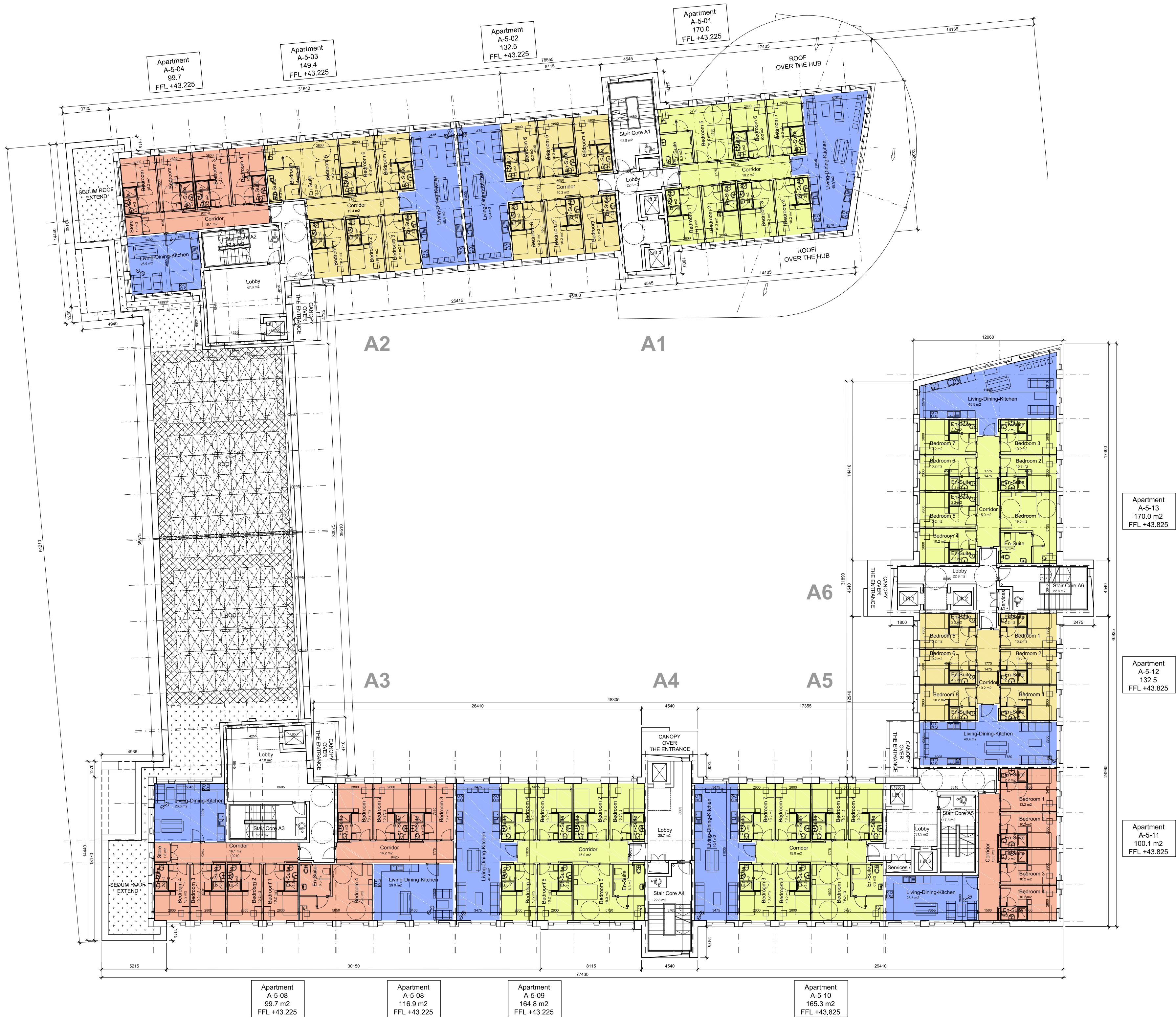
BLOCK A - APARTMENTS FIFTH FLOOR PLAN SCALE 1:200