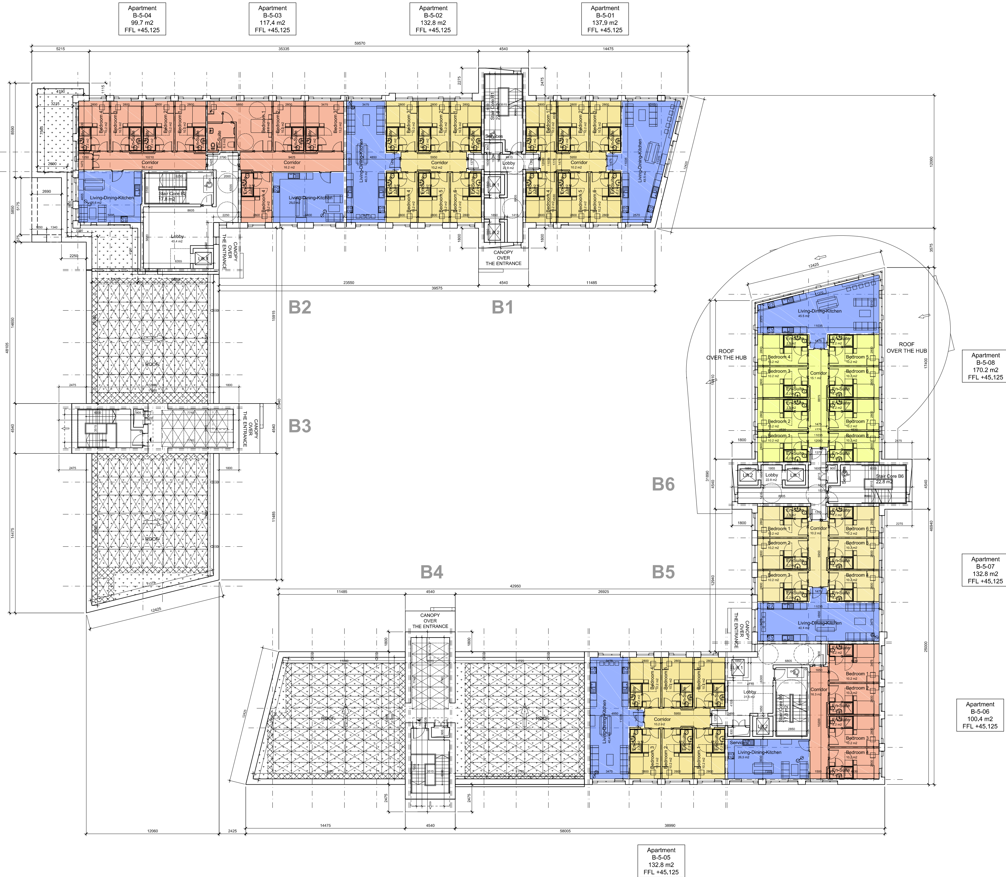
BLOCK B - APARTMENTS FIFTH FLOOR PLAN SCALE 1:200