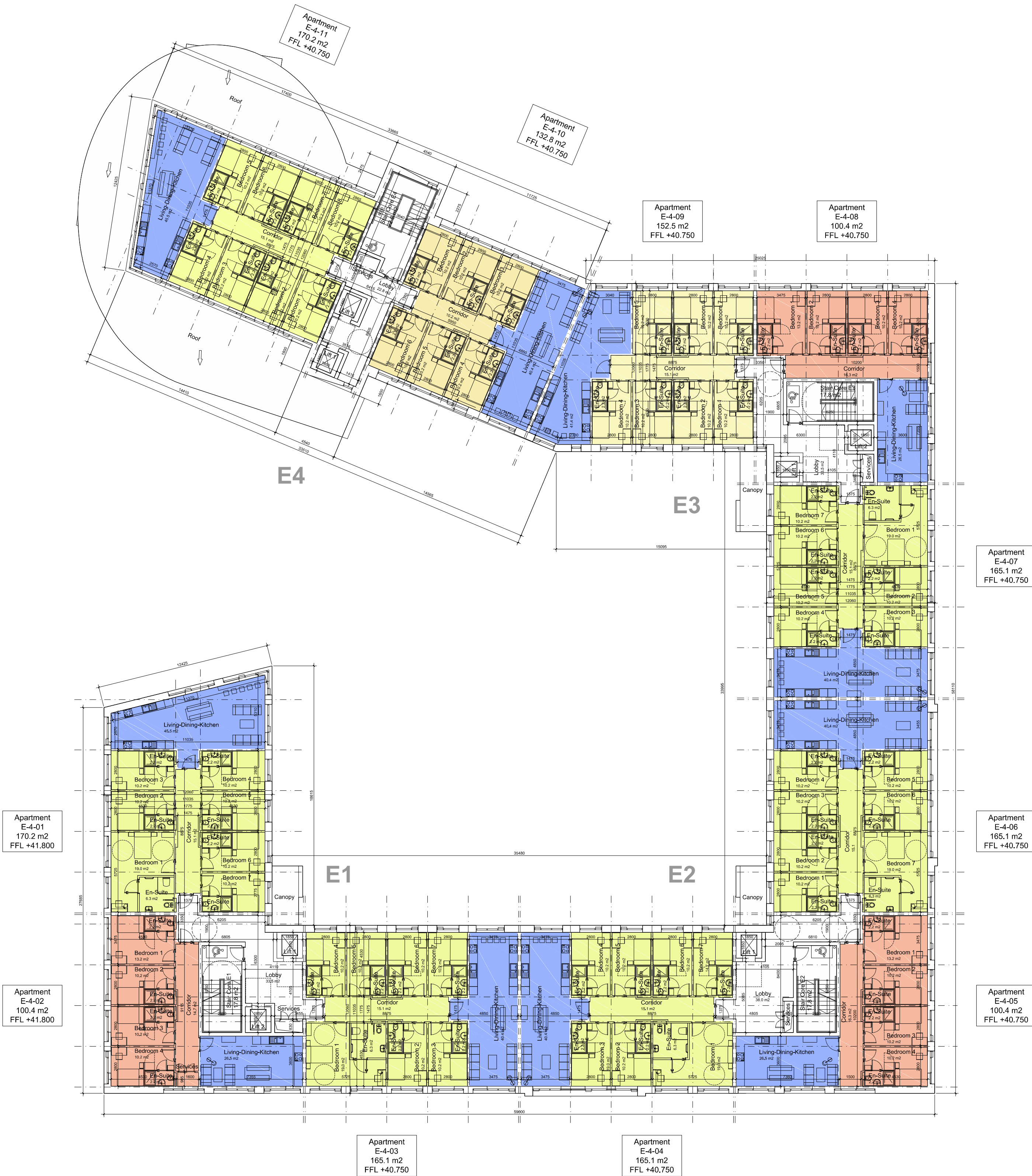
BLOCK E - APARTMENTS FOURTH FLOOR PLAN SCALE 1:200