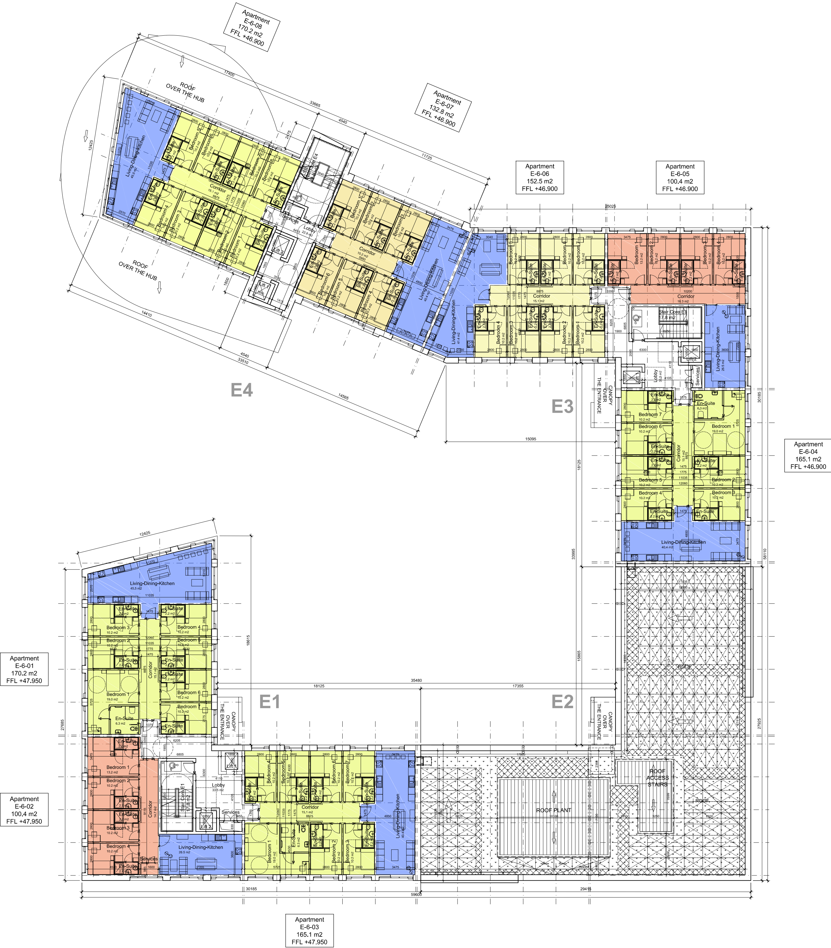
BLOCK E - APARTMENTS SIXTH FLOOR PLAN SCALE 1:200