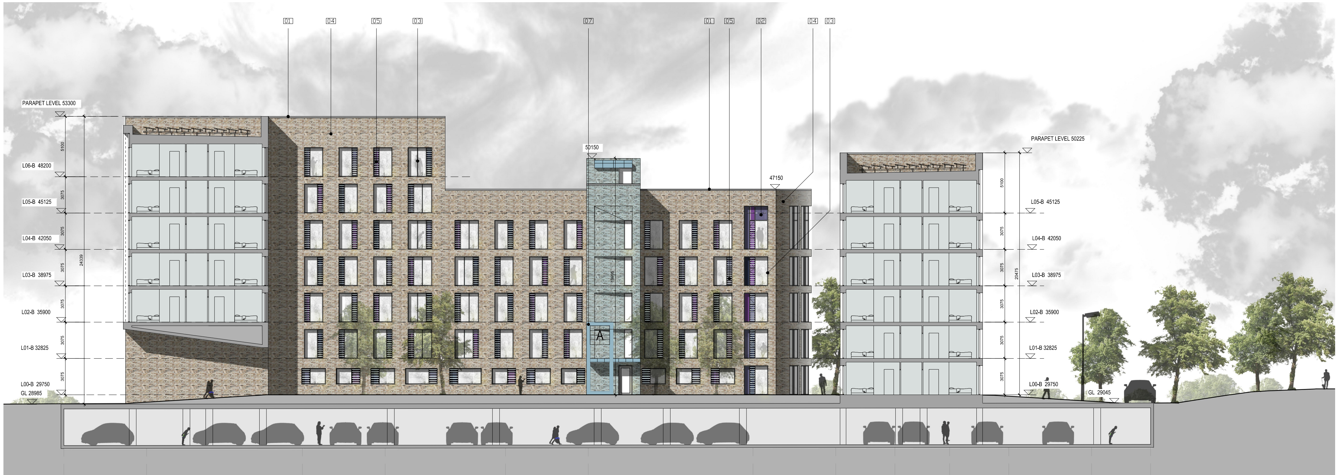
BLOCK B - NORTH ELEVATION (COURTYARD) SCALE 1:200