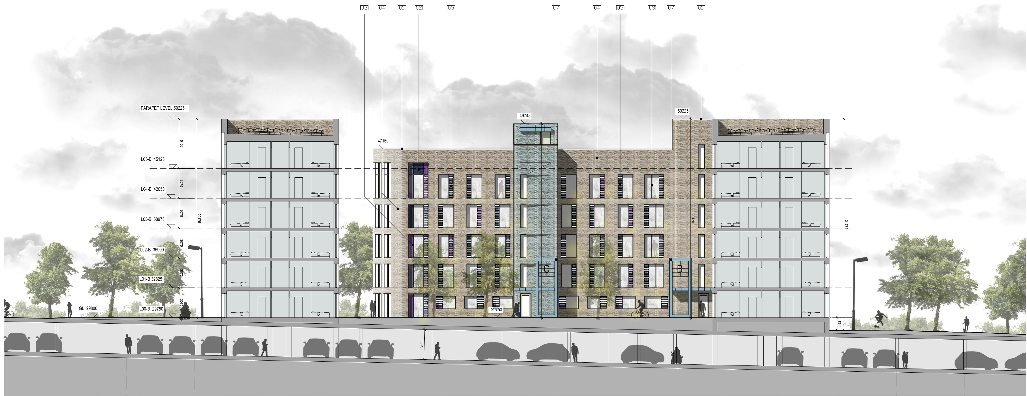
BLOCK B - EAST ELEVATION (COURTYARD) SCALE 1:200

DO NOT SCALE FROM THIS DRAWING. USE FIGURED DIMENSIONS IN ALL CASES. VERIFY DIMENSIONS ON SITE AND REPORT ANY DISCREPANCIES TO THE ARCHITECTS IMMEDIATELY. THIS DRAWING TO BE READ IN CONJUNCTION WITH THE ARCHITECTS SPECIFICATION. © THIS DRAWING IS COPYRIGHT AND MAY ONLY BE REPRODUCED WITH THE ARCHITECTS PERMISSION.