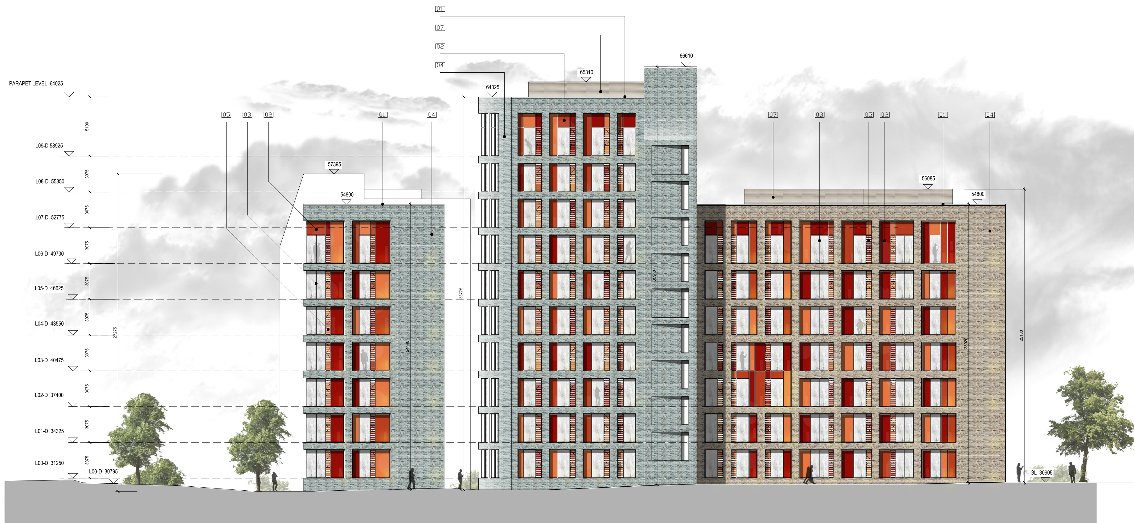
BLOCK D - WEST ELEVATION (EXTERNAL) SCALE 1:200

DO NOT SCALE FROM THIS DRAWING. USE FIGURED DIMENSIONS IN ALL CASES. VERIFY DIMENSIONS ON SITE AND REPORT ANY DISCREPANCIES TO THE ARCHITECTS IMMEDIATELY. THIS DRAWING TO BE READ IN CONJUNCTION WITH THE ARCHITECTS SPECIFICATION. © THIS DRAWING IS COPYRIGHT AND MAY ONLY BE REPRODUCED WITH THE ARCHITECTS PERMISSION.