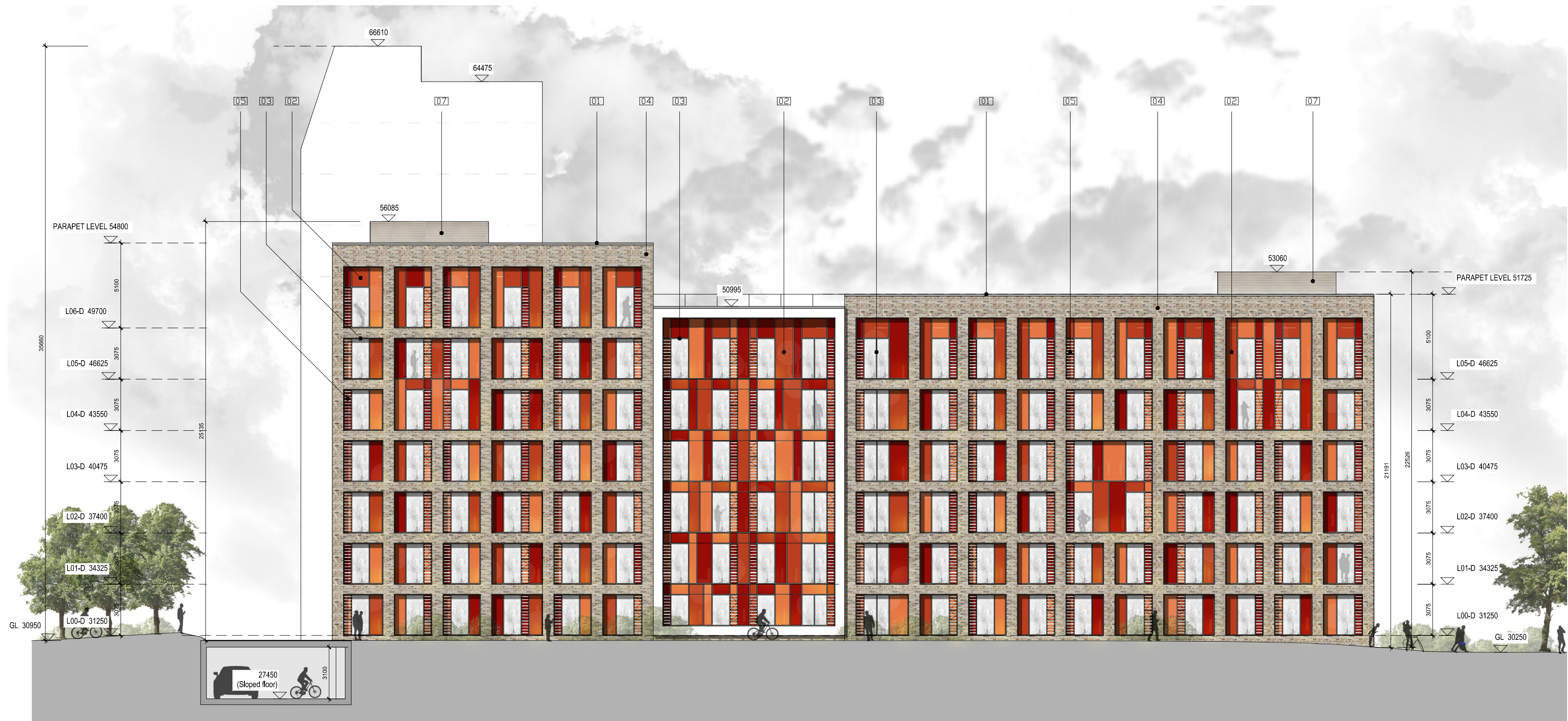
BLOCK D - SOUTH ELEVATION (EXTERNAL) SCALE 1:200