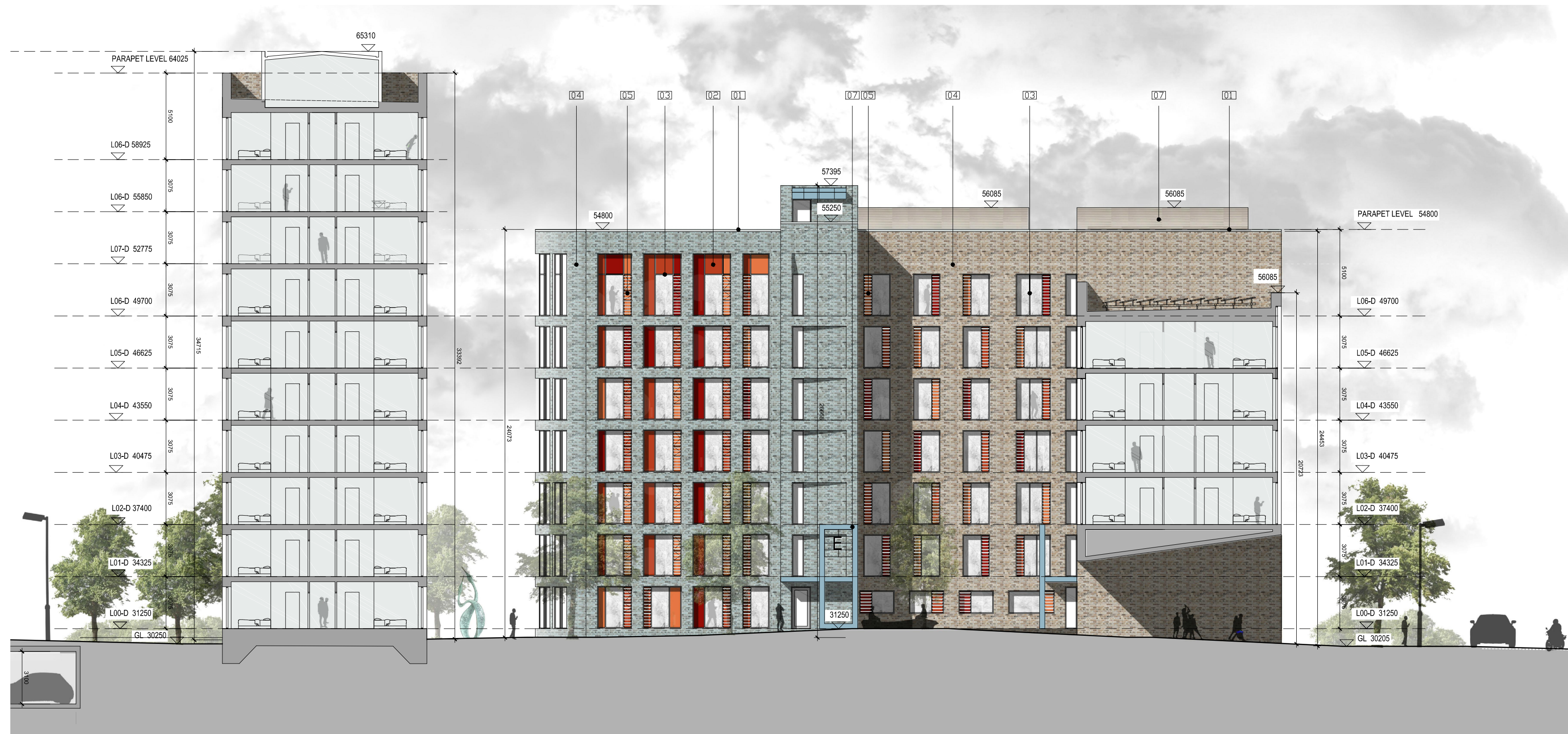
BLOCK D - SOUTH ELEVATION (COURTYARD) SCALE 1:200

JOB NO. DWG NO. REVISION 15-052 3.1 243 -