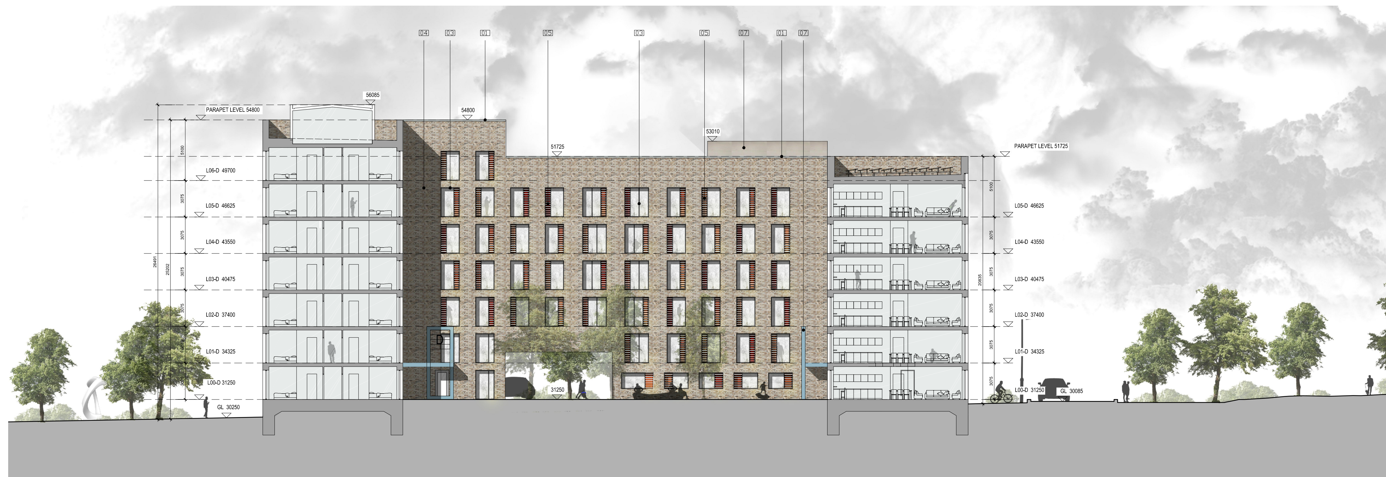
BLOCK D - WEST ELEVATION (COURTYARD) SCALE 1:200