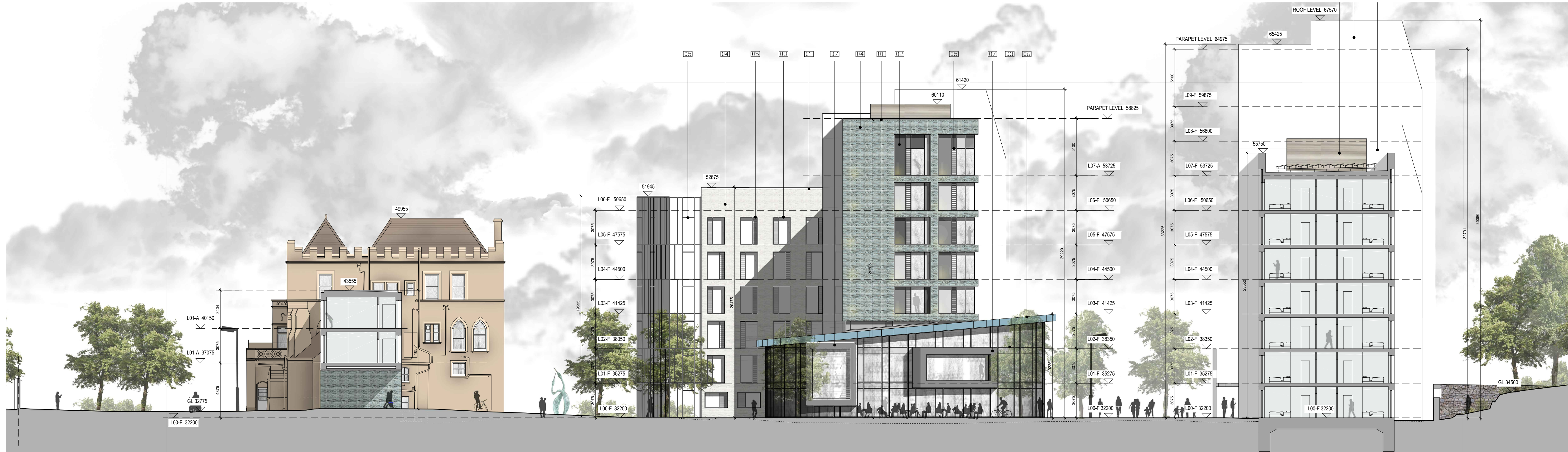
BLOCK F1 - SOUTH ELEVATION BLOCK F3 - SECTION SCALE 1:200