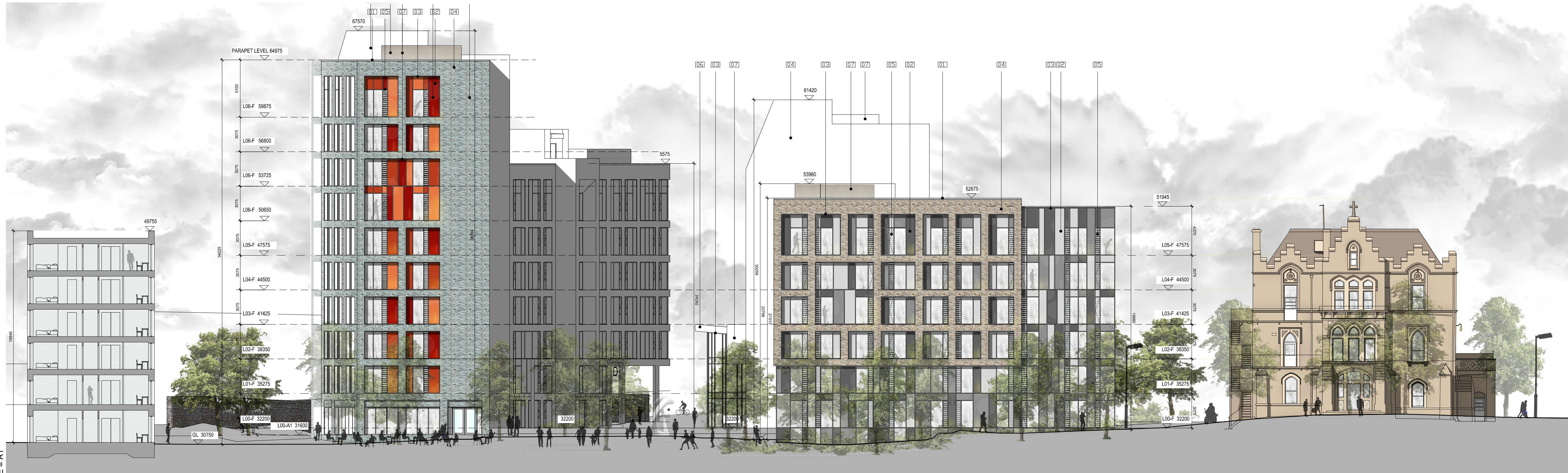
BLOCK F1 - NORTH ELEVATION & BLOCK F3 - NORTH ELEVATION SCALE 1:200