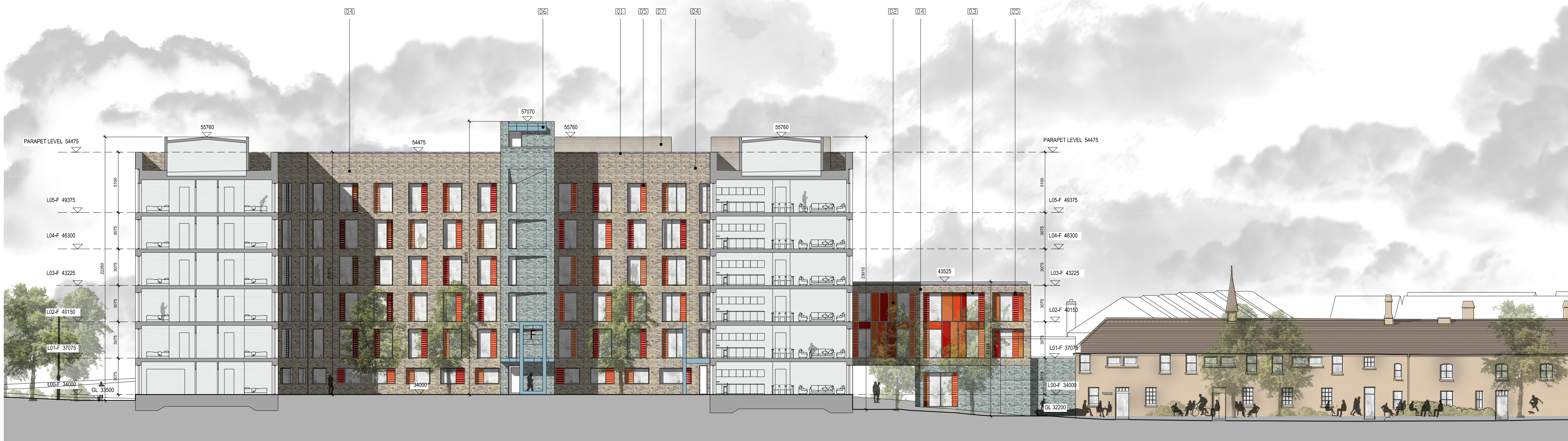
BLOCK F2 - EAST ELEVATION (COURTYARD) SHOWING PROPOSED BUILDING AND PART OF ADJOINING STABLES SCALE 1:200