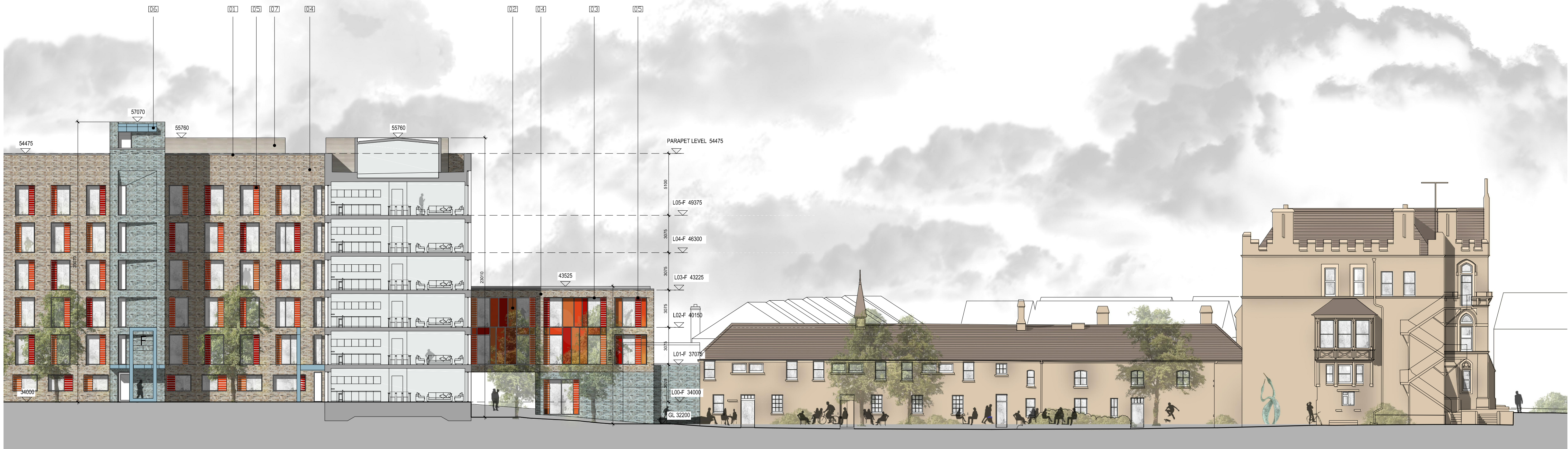
BLOCK F2 - EAST ELEVATION (COURTYARD) SHOWING PART OF PROPOSED BUILDING AND ADJOINING STABLES AND CASTLE SCALE 1:200