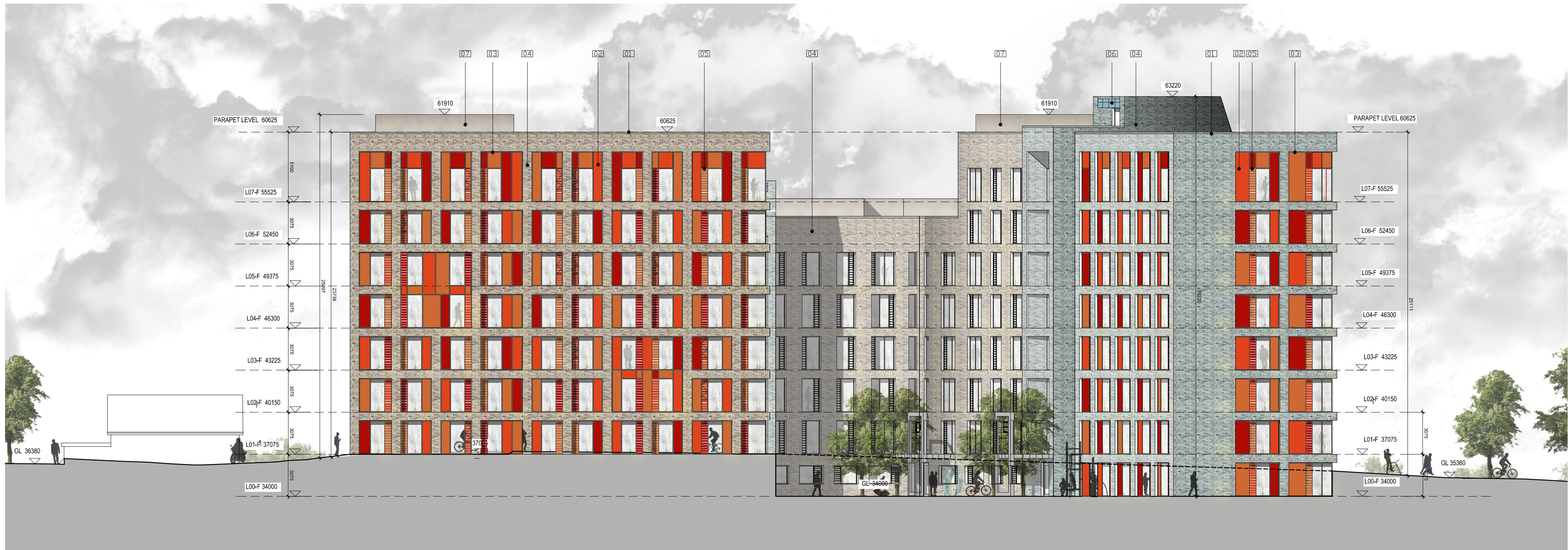
BLOCK F2 - EAST ELEVATION SCALE 1:200