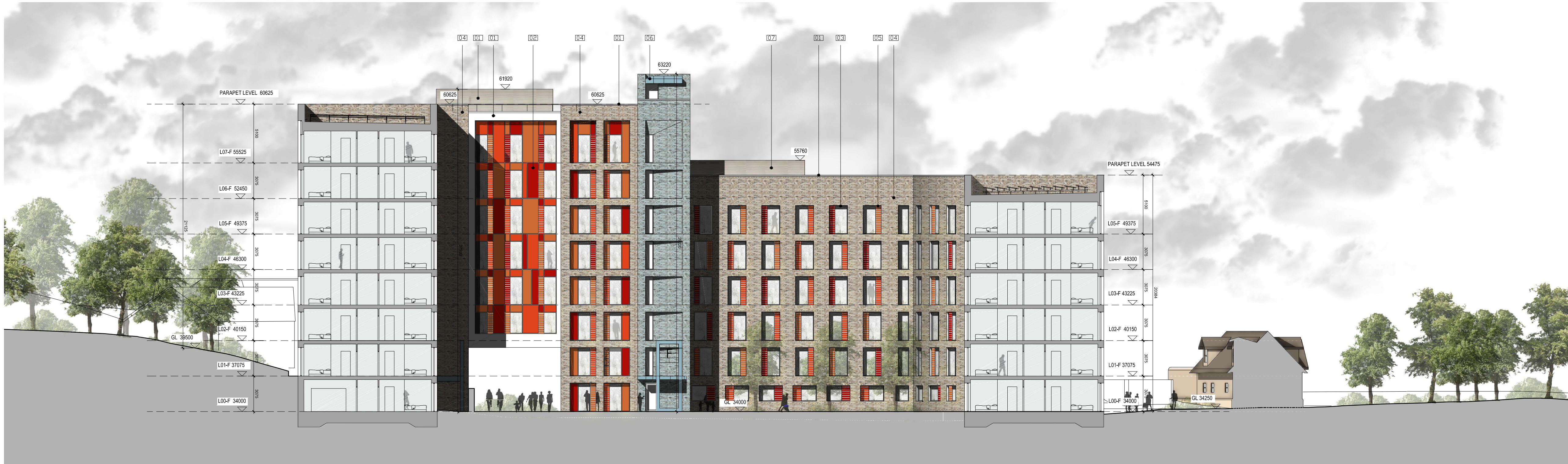
BLOCK F2 - NORTH COURTYARD ELEVATION SCALE 1:200