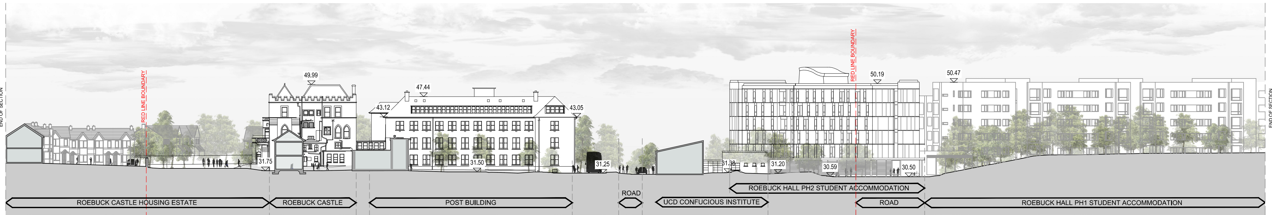
EXISTING CONTEXTUAL SECTION J-J SCALE 1:500 (A1)