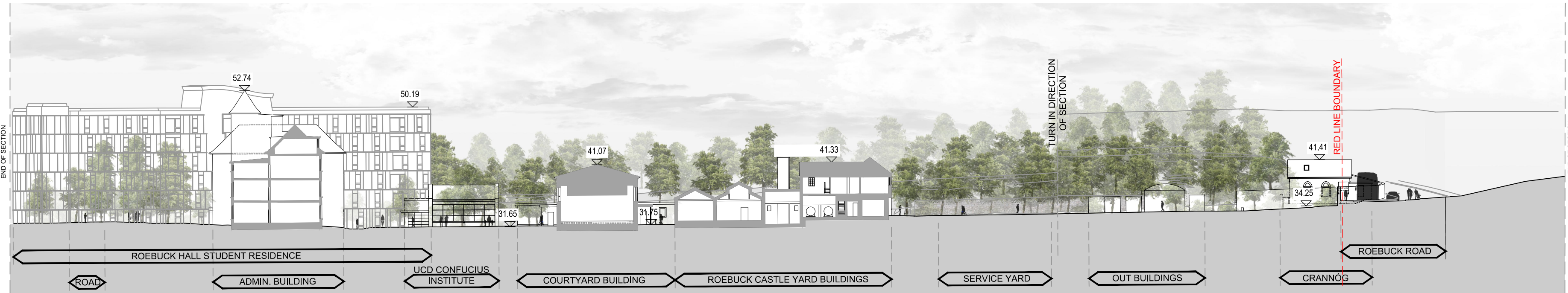
EXISTING CONTEXTUAL SECTION H-H SCALE 1:500 (A1)