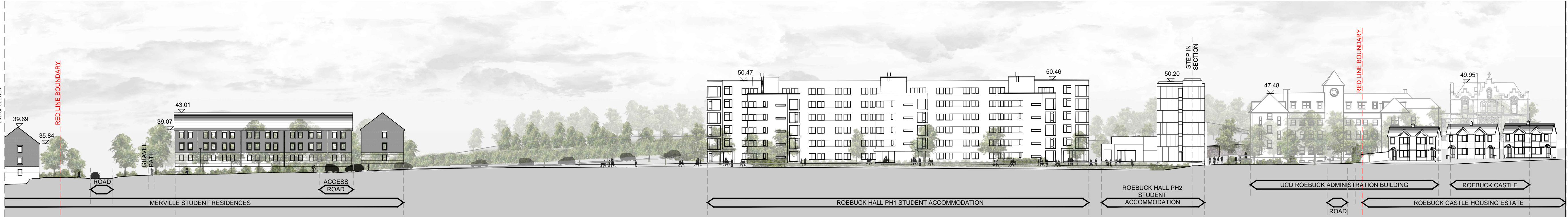
EXISTING CONTEXTUAL SECTION G-G SCALE 1:500 (A1)

DO NOT SCALE FROM THIS DRAWING. USE FIGURED DIMENSIONS IN ALL CASES. VERIFY DIMENSIONS ON SITE AND REPORT ANY DISCREPANCIES TO THE ARCHITECTS IMMEDIATELY. THIS DRAWING IS TO BE READ IN CONJUNCTION WITH THE ARCHITECTS SPECIFICATION. © THIS DRAWING IS COPYRIGHT AND MAY ONLY BE REPRODUCED WITH THE ARCHITECTS PERMISSION.