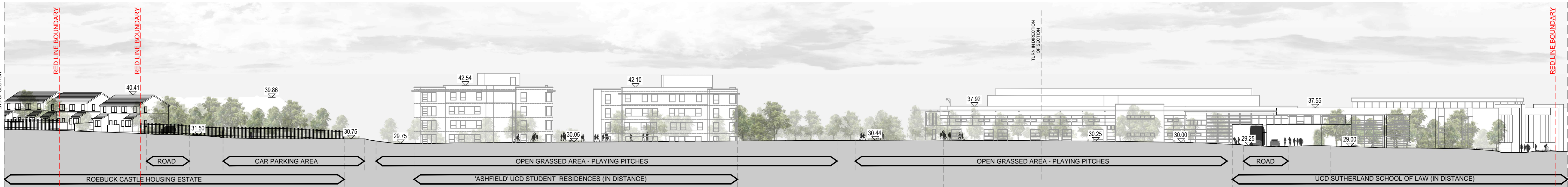
EXISTING CONTEXTUAL SECTION L-L SCALE 1:500 (A1)