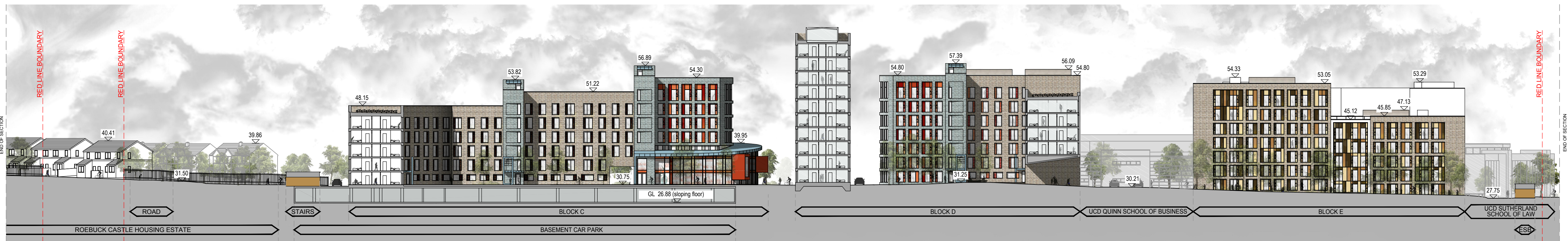
PROPOSED CONTEXTUAL SECTION L-L SCALE 1:500 (A1)