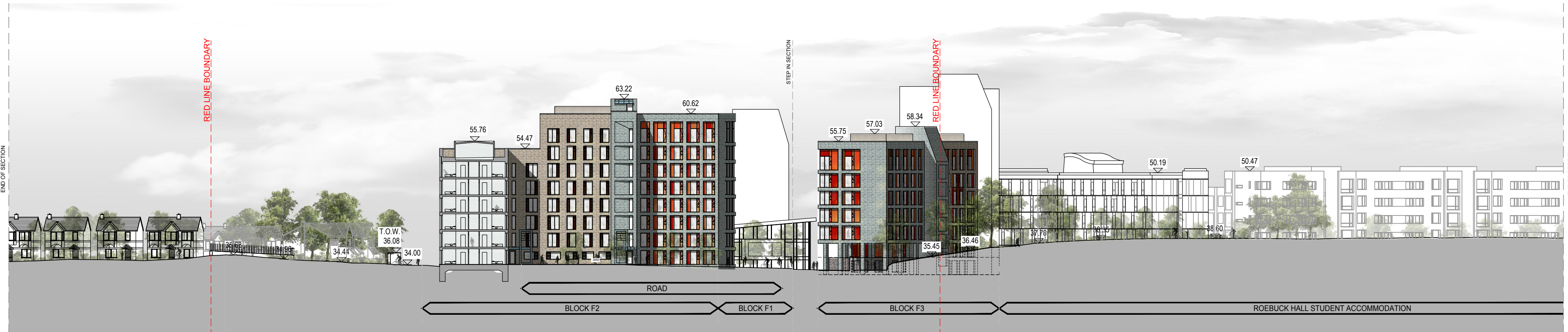
PROPOSED CONTEXTUAL SECTION K-K SCALE 1:500 (A1)