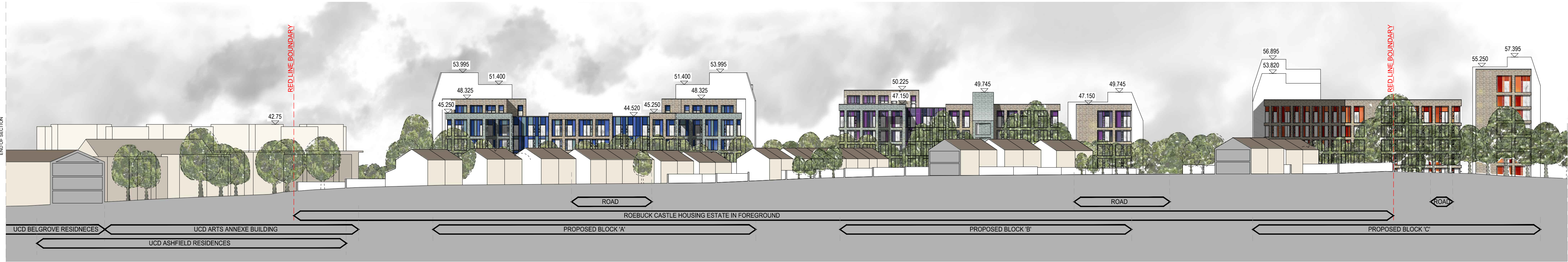
PROPOSED CONTEXTUAL SECTION N-N SCALE 1:500 (A1)