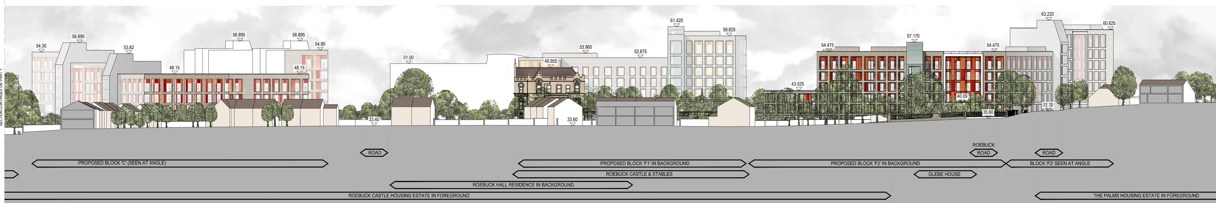
PROPOSED CONTEXTUAL SECTION O-O (PART 2 OF 2) SCALE 1:500 (A1)

DO NOT SCALE FROM THIS DRAWING. USE FIGURED DIMENSIONS IN ALL CASES. VERIFY DIMENSIONS ON SITE AND REPORT ANY DISCREPANCIES TO THE ARCHITECTS IMMEDIATELY. THIS DRAWING TO BE READ IN CONJUNCTION WITH THE ARCHITECTS SPECIFICATION. © THIS DRAWING IS COPYRIGHT AND MAY ONLY BE REPRODUCED WITH THE ARCHITECTS PERMISSION.