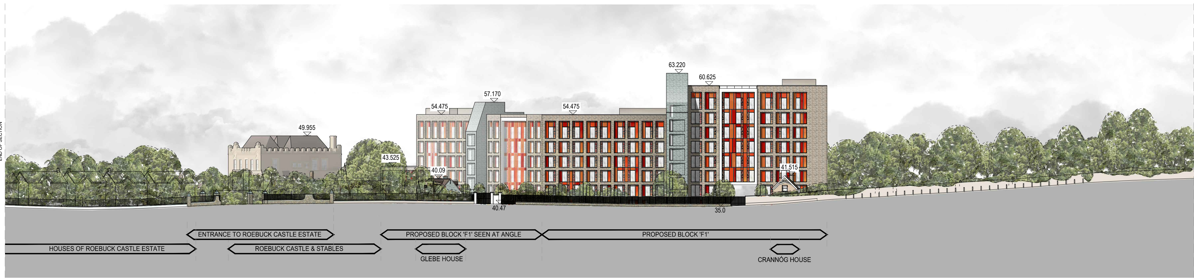
PROPOSED CONTEXTUAL SECTION M-M SCALE 1:500 (A1)